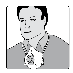
6. Let mask hang around your neck.