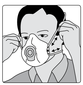
4. Adjust strap by pulling loop on strap.

3. Pull upper strap and place on back of head.